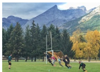
Burpies! Burpies! Burpies! The race team doing some dryland training.